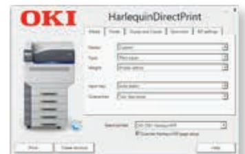
Harlequin MultiRIP 10